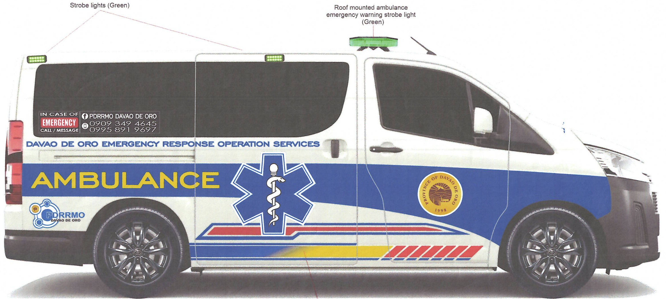
Strobe lights (Green)